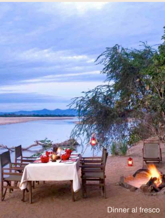
Dinner al fresco

Although the main activity at Island Bush Camp is walking safaris, we do also use a safari vehicle to get into a variety of walking areas or return from a walk after dark to discover some of the nocturnal wildlife in the area.