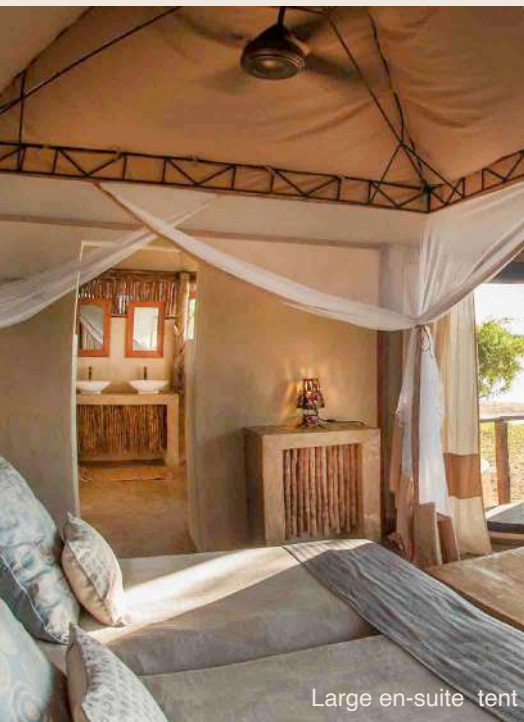
Large en-suite tent

Three Rivers Camp is an absolute gem of a tented camp. The drive to the camp is a mere 2 hours from Kafunta, heading south and passing through dense mopane forests and remote villages while bordering the national park.