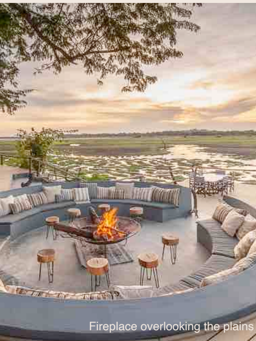
Fireplace overlooking the plains