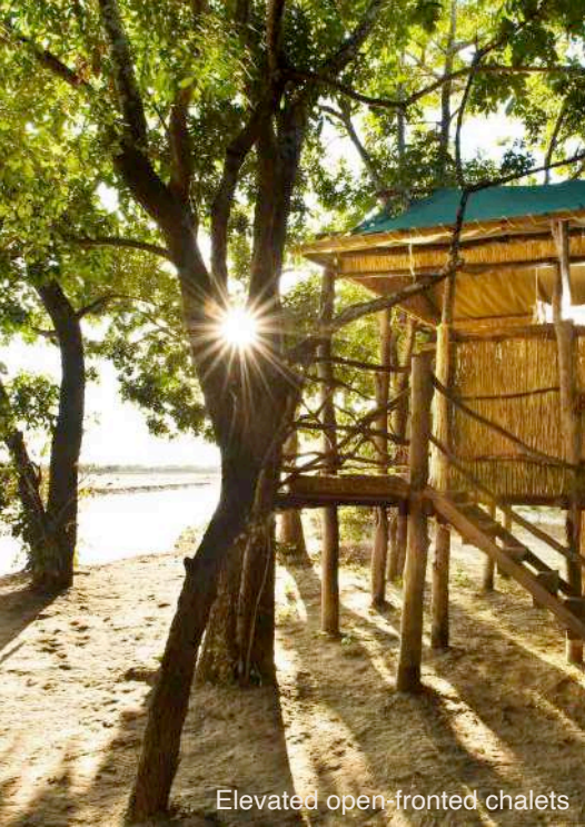
Elevated open-fronted chalets

Island Bush Camp is our charming authentic camp, located well off the beaten tracks and immersed in pure wilderness. The camp is set under the cool shade of old mahogany trees on the banks of the Luangwa River.