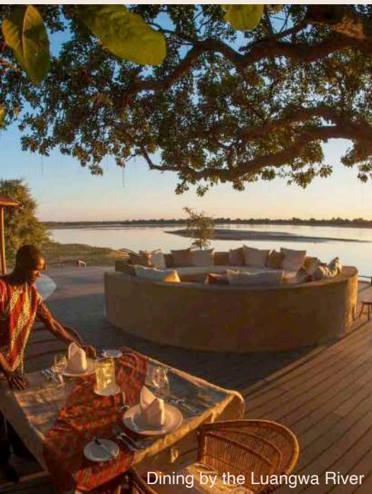
Dining by the Luangwa River