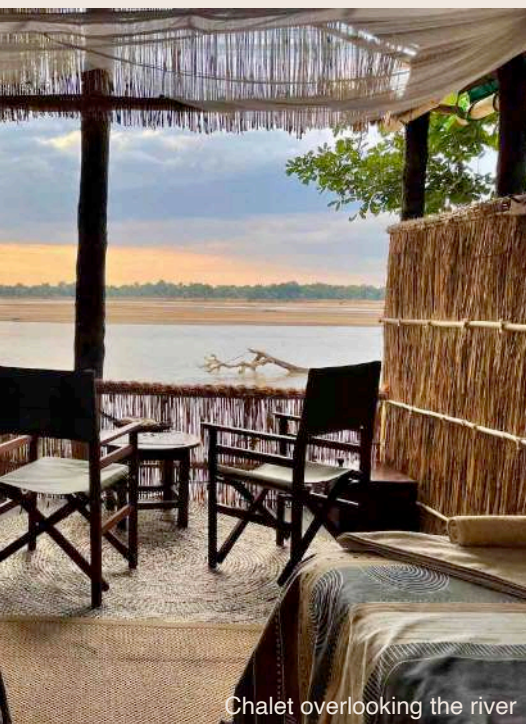
Chalet overlooking the river