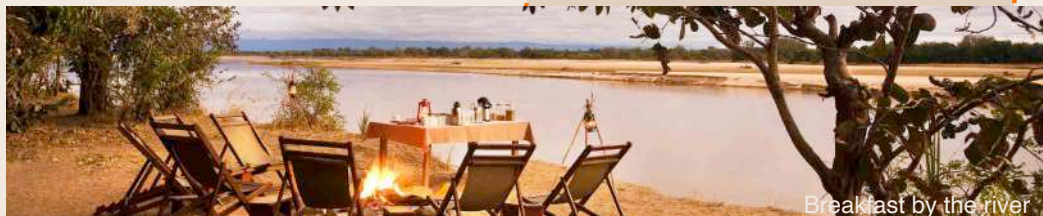
Breakfast by the river