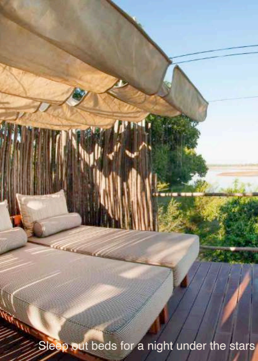
Sleep out beds for a night under the stars