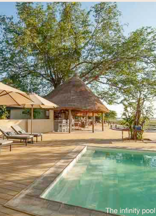
The infinity pool

Fully renovated in 2019, Kafunta is a distinctive Zambian safari lodge with a contemporary touch; it combines all the ingredients to create an exceptional safari. Here you will find the rest and peace you need after an exciting day in the bush in combination with attentive service and a warm welcome by our team.