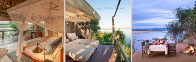
Kafunta River Lodge Three Rivers Camp Island Bush Camp